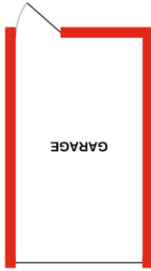
GROUND FLOOR (47.0 sq.m.) approx.

A professional removal company takes the stress out of moving, knowing that your belongings are safe and insured far outweighs any small savings by trying to do it yourself or using a man-and-a-van service. We work closely with and recommend Cube Removals as the leading local firm. For peace of mind and a reliable service call them on 0800 193 0000 or visit their website, cuberemovals.co.uk , to arrange a survey.